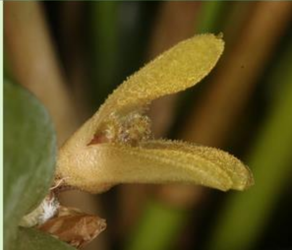
Side view of Restrepiella ophiocephala flower.