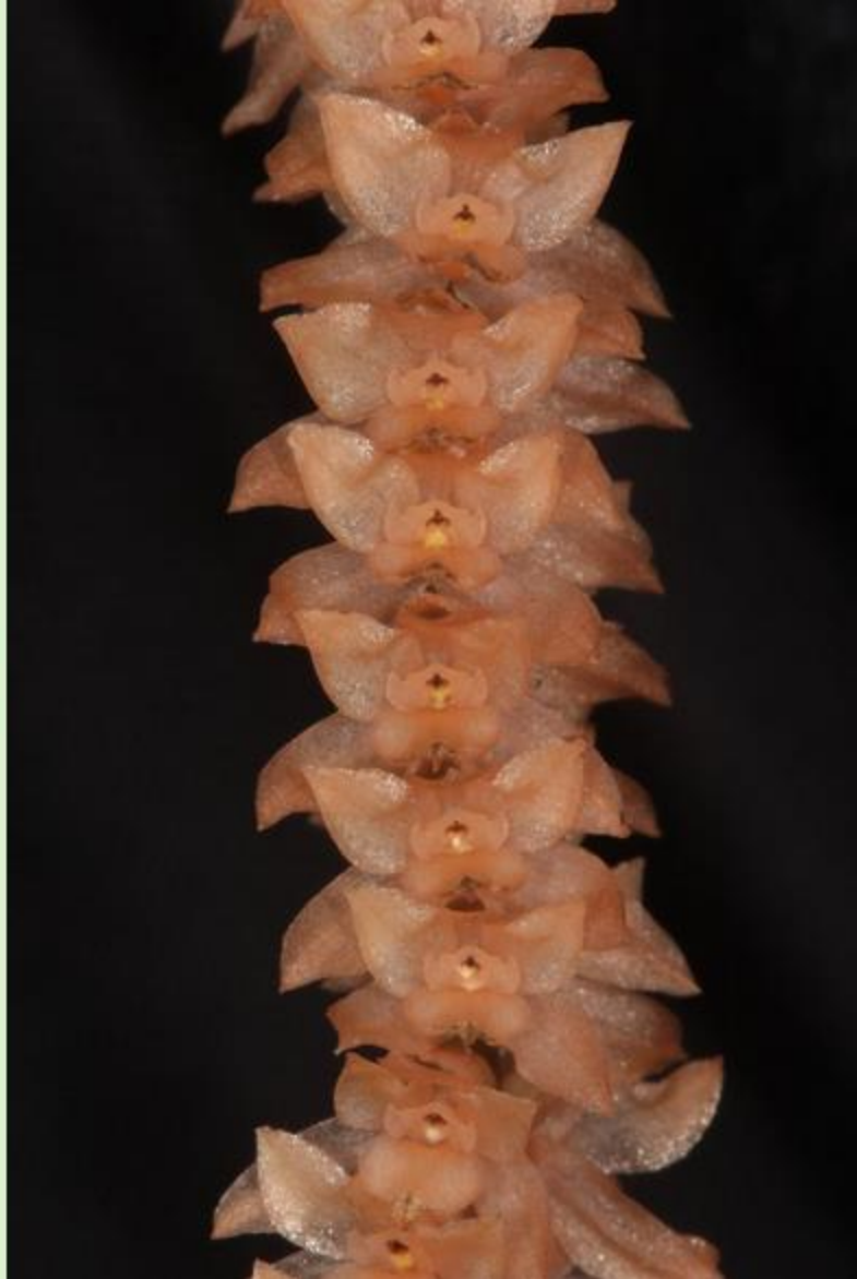
Closeup of front view of Dendrochilum bicallosum flowers.