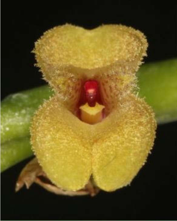
Front view of Restrepiella ophiocephala flower.