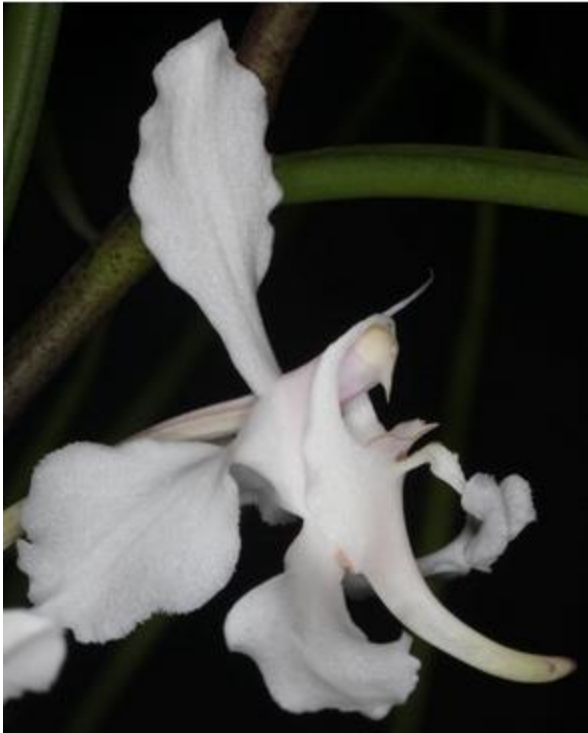
Side view of Papilionanthe vanadarum flower.