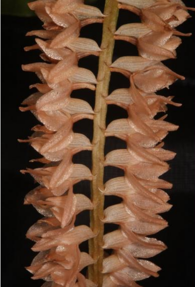
Side view of Dendrochilum bicallosum flowers.