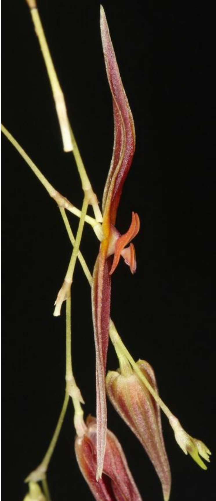
Side view of Lepanthes elegantula x L. ionoptera flower.