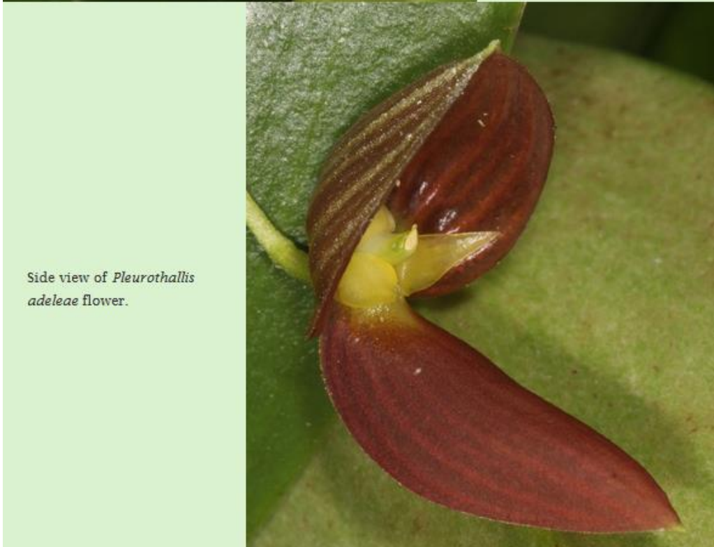
Side view of Pleurothallis adeleae flower.

Pleurothallis adeleae . Is a warm to cool growing terrestrial species found in Ecuador and Bolivia at elevations of 1450 to 2250 meters. This orchid is growing in a clay pot filled with sphagnum moss that is placed in a cool greenhouse. Grown by Chris Ehrler.