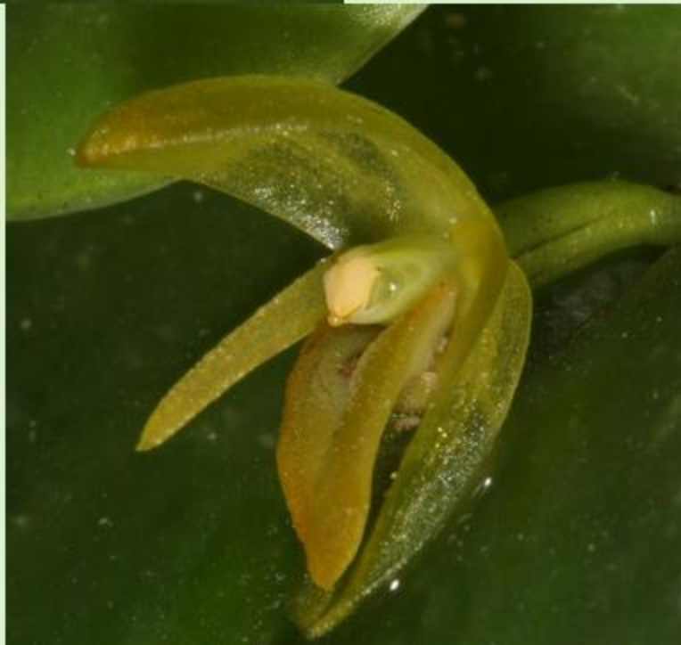
Side view of the unknown Pleurothallis species flower.

An unknown Pleurothallis species. Flowers are about 1/4 inch in size. Growing in a clay pot filled with a mixture of bark and lava rock which is placed in a cool greenhouse. Grown by Chris Ehrler.