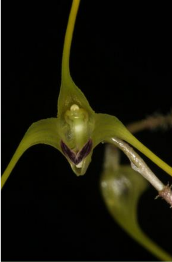
Front view of Porroglossum muscosum flower with the lip in the down (normal) positions. When lip is triggered it moves upwards to the closed position (see photo above).

Restrepiella ophiocephala leaf and flower. Some of the flowers currently have three buds which will open soon. There are only four species in this genus. This is hot to cool growing species found in Florida USA, Mexico, Belize, Guatemala, El Salvador, Honduras, Costa Rica and Colombia growing at elevations of 40 to 1600 meters. This orchid is growing in a clay pot filled with sphagnum moss but is also growing successfully mounted. But the pot and mounted orchids are growing in a cool greenhouse. Grown by Chris Ehrler.