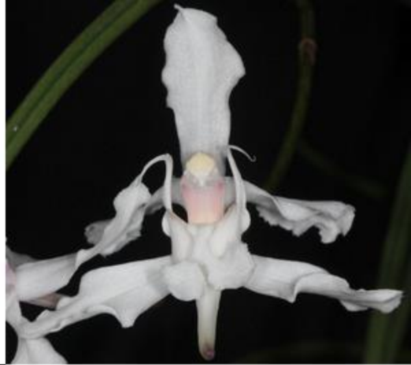
Front view of Papilionanthe vanadarum flower.