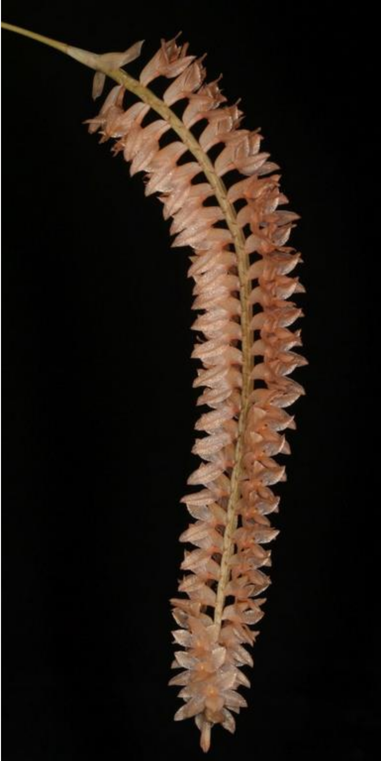
Side view of Dendrochilum bicallosum spike.