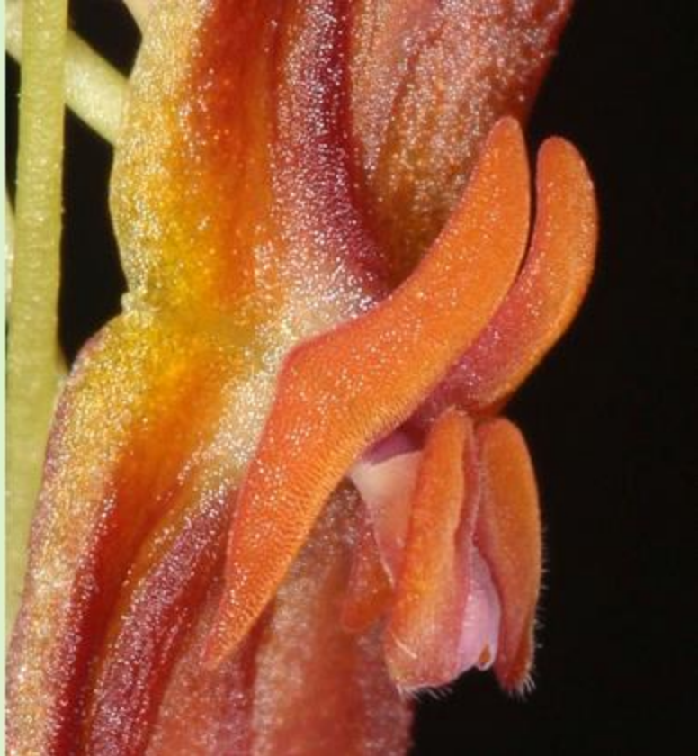
Closeup of Lepanthes elegantula x L. ionoptera .