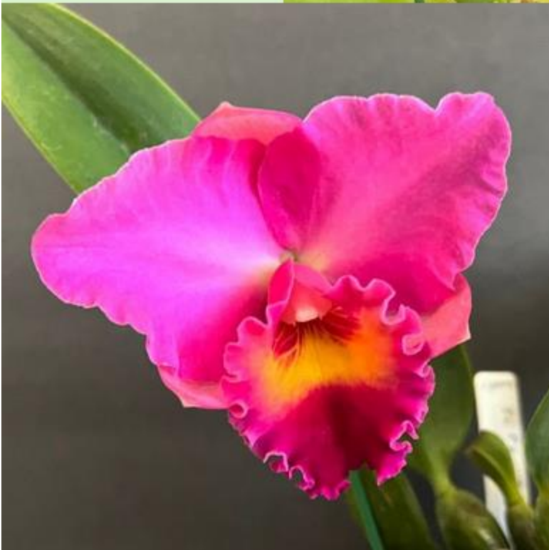
Sc Ra 'Bar'. We acquired this 'mathematical' gem at the FCOS Christmas party in '22. The bloom is such a great surprise. An equilateral triangle shaped flower. As with most of our greenhouse orchids, it gets fed and watered weekly.