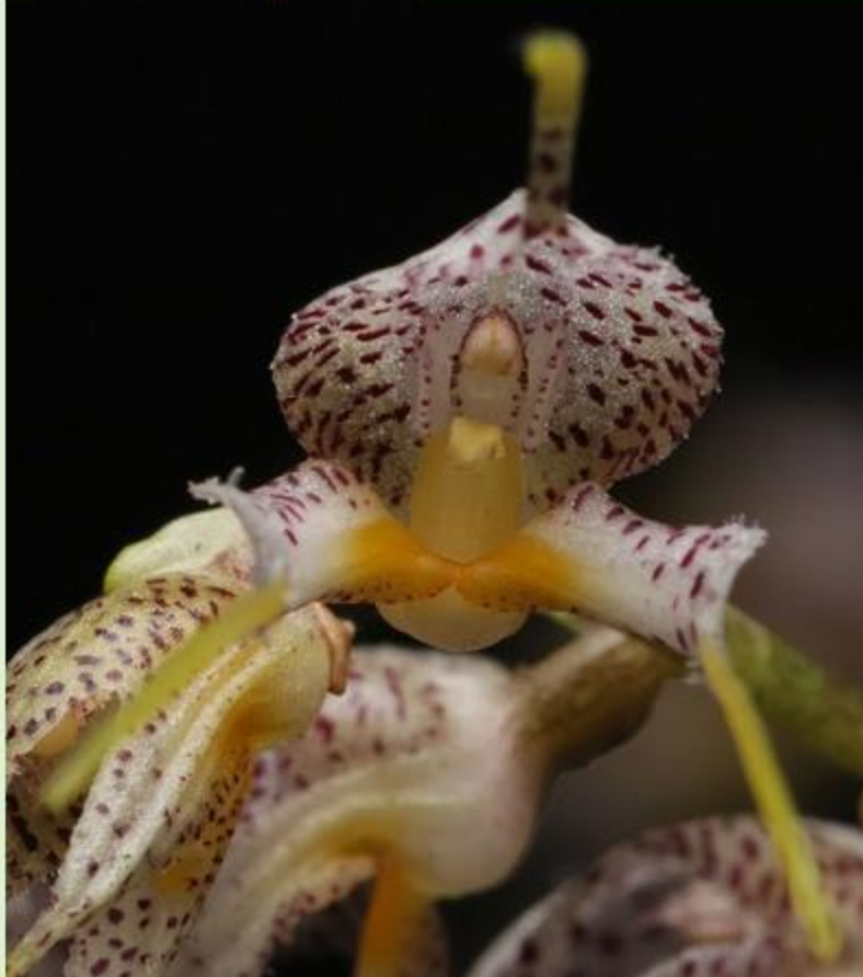
Closeup of Masdevallia polysticia flower.

Masdevallia polysticia . A cool to cold growing orchid found at elevations of 1600 to 3000 meters in Ecuador and Peru. Growing in a cool greenhouse mounted on a piece of cork oak with some sphagnum moss on the roots. Grown by Chris Ehrlar.