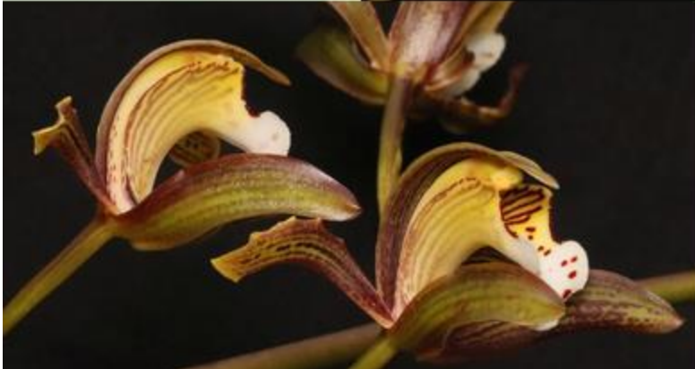
Side view of Cymbidium erythraeum flower.