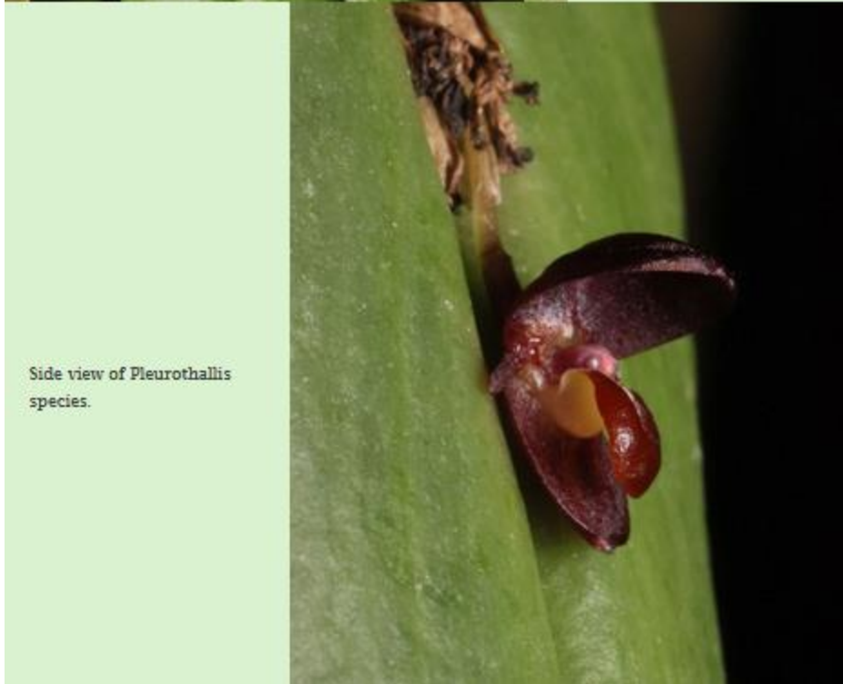
Side view of Pleurothallis species.