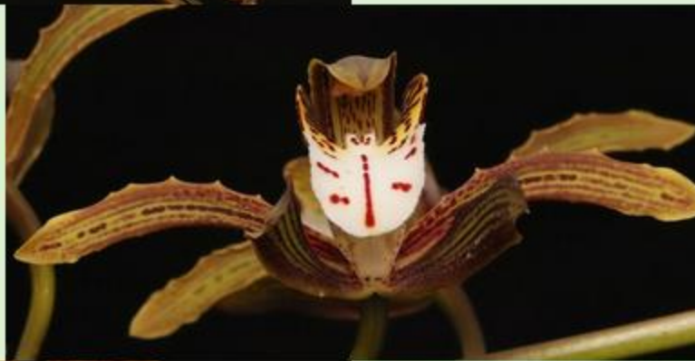
Front view of Cymbidium erythraeum flower.

Cymbidium erythraeum . A species of cymbidium that grows at elevations of 1000 to 2400 meters in Assam India, eastern Himalayas, Nepal, Bhutan, western Himalayas, Myanmar, China and Vietnam. Grown outside in a plastic pot filled with bark and lava rock. Grown by Chris Ehrler.