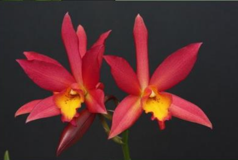
Lc. Hot Sauce: Wonderful color. Grown by Eric Holenda.