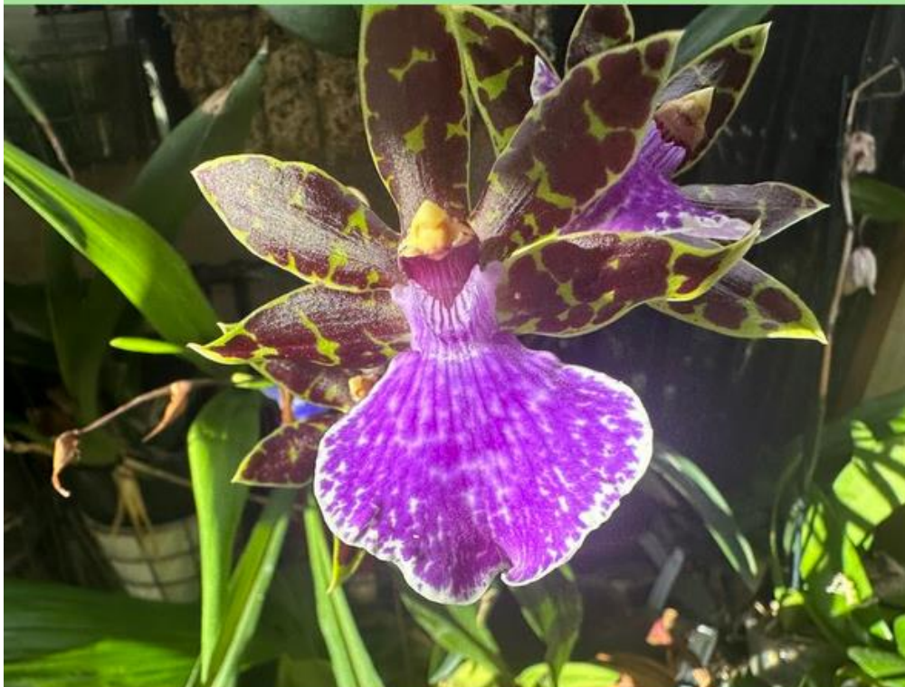
Zygopetalum hybrid, blooming under LED lights in my backyard grow shed in Los Osos.