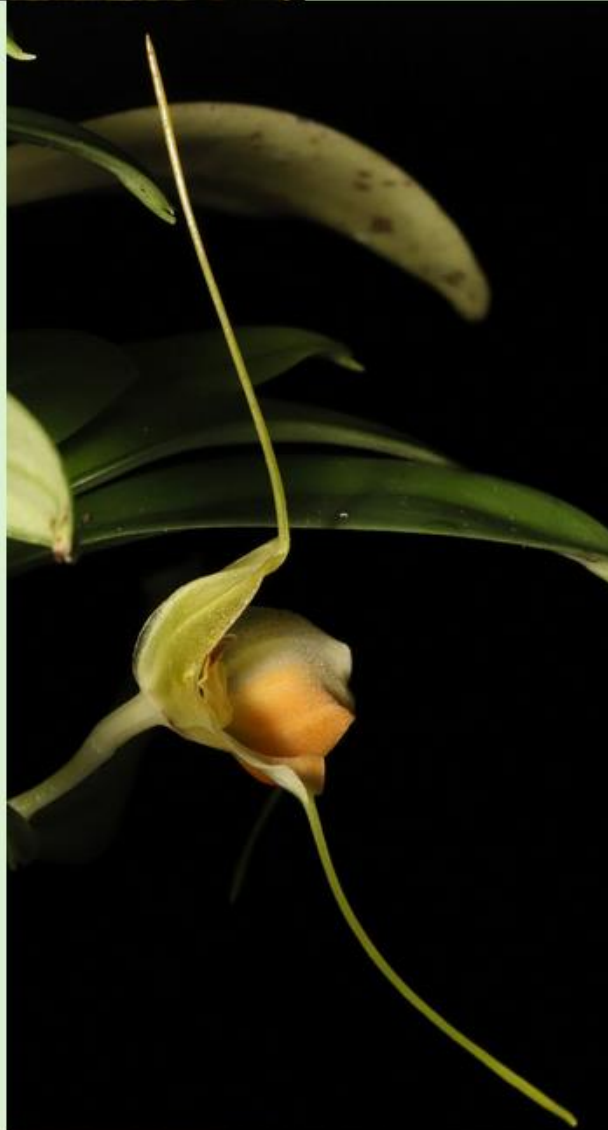
Side view of Masdevallia santae-inesae flower.

Masdevallia santae-inesae . A cool to cold growing epiphyte found in southern Ecuador in cloud forests at an elevation of 1900 to 2500 meters. Growing in a cool greenhouse mounted on a piece of cork oak with some sphagnum moss on the roots. Grown by Chris Ehrler.