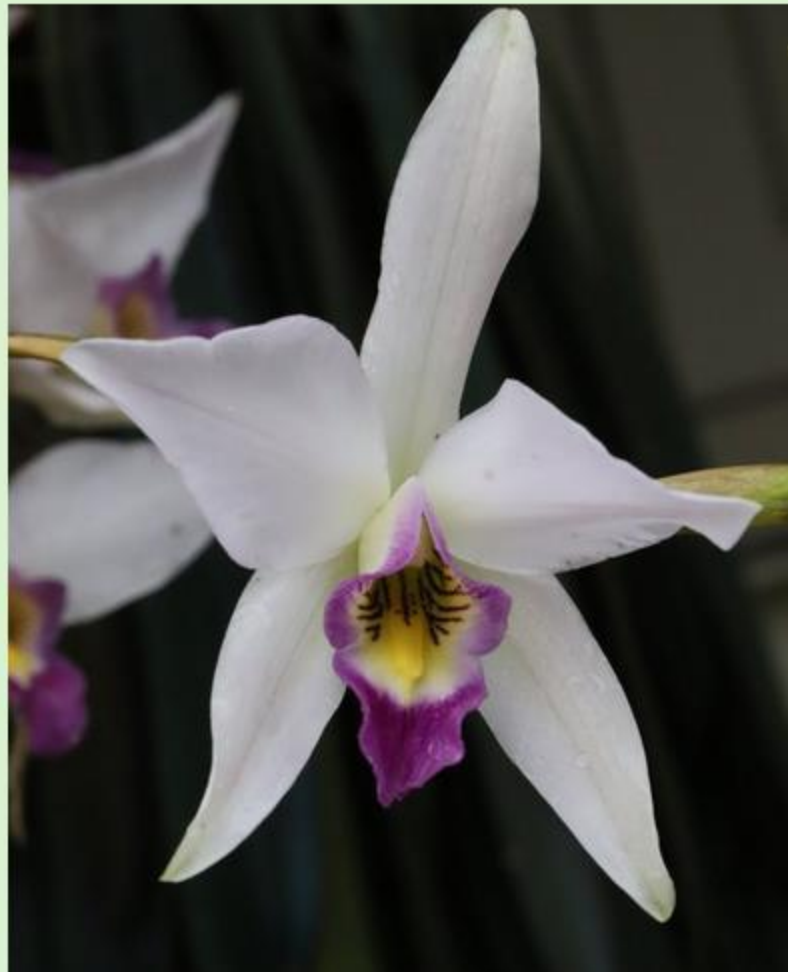
Laelia anceps Fort Caroline flower.