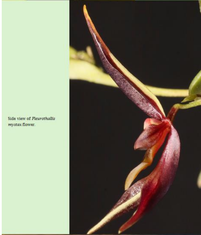
Side view of Pleurothallis mystax flower.

Pleurothallis mystax . Found in Panama in cloud forests at elevations of 650 to 1000 meters. Literature states this is a warm growing epiphyte, but this plant is growing well in a cool greenhouse where winter night temperatures can be as low as 40F. Growing in a clay pot filled with sphagnum moss. Grown by Chris Ehler.