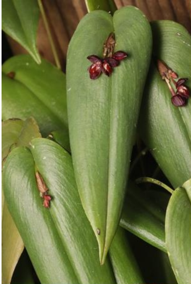
Unknown species of Pleurothallis. Growing mounted to a piece of wood with sphagnum moss on the roots with it placed in a cool greenhouse. Blooms better under low light conditions. Grown by Chris Ehler.