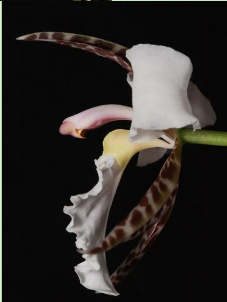
Side view of Rhyncho스테레 rossii flower.

Rhyncho스테레 (formerly Lembroglossum ) rossii . Found in Nicaragua, Honduras, Salvadorean, Guatemala and Mexico growing as a cold to cool growing epiphytic at elevations of 2000-3000 meters. Growing in a cool greenhouse in a clay pot filled with sphagnum moss. Grown by Chris Ehrler.