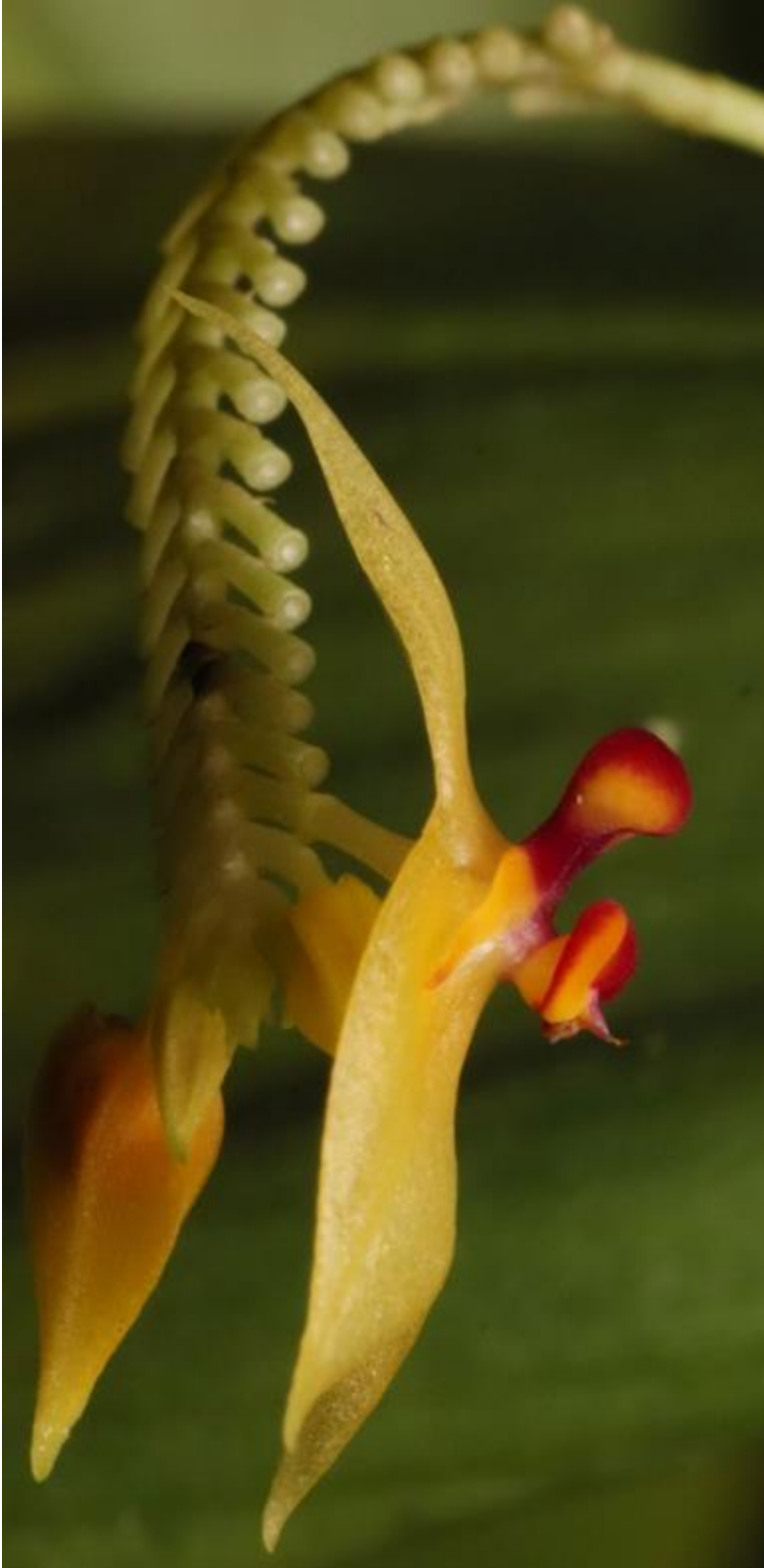
Side view of Lepanthes ligae flower.