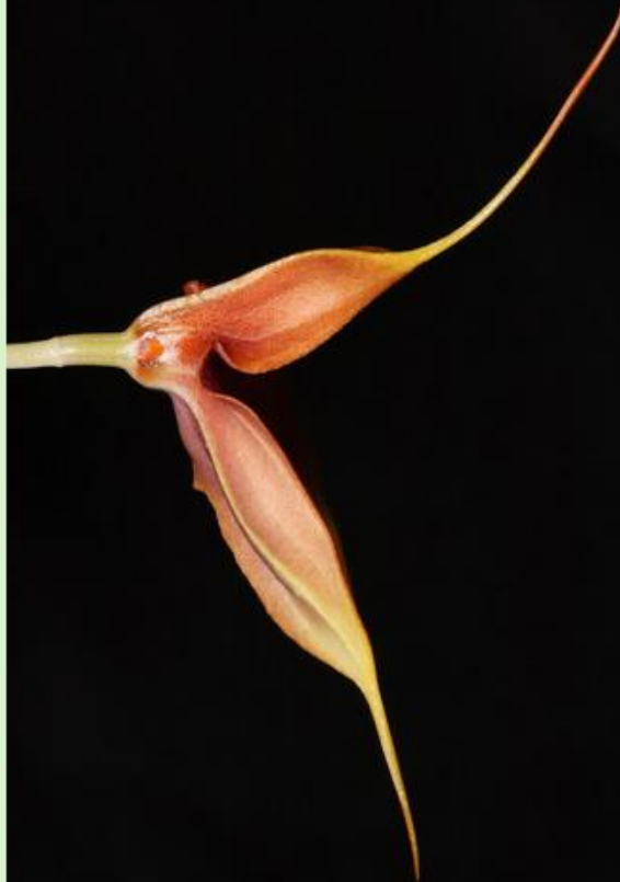
Side view of Masdevallia Copperwing.

Masdevallia Copperwing. A cross between Masdevallia veitchiana and Masdevallia decumana which was registered by the Orchid Zone in 1993. Growing in a cool greenhouse mounted on a piece of cork oak with some sphagnum moss on the roots. Grown by Chris Ehrler.