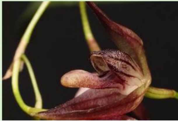
Side view of Fleurothallis pachyglossa flower.

Grows as a cool to warm epiphyte in Mexico, Guatemala, Honduras and Costa Rica at elevations of 500 to 1700 meters. This plant was purchased many years ago off the $7.50 table at Santa Barbara Orchid Estate. Grown outside under wood lath on the north side of the house. Growing mounted to a piece of cork oak with sphagnum moss on the roots. Grown by Chris Ehrler.