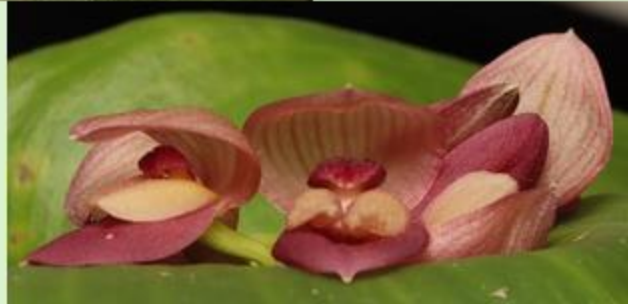
Closeup of Pleurothallis marthae flower.

Pleurothallis marthae . A LARGE leaved epiphytic species growing in cold conditions in Colombia. Growing in a clay pot filled with bark and lava rock which is place in a cool greenhouse. Grown by Chris Ehrlar.