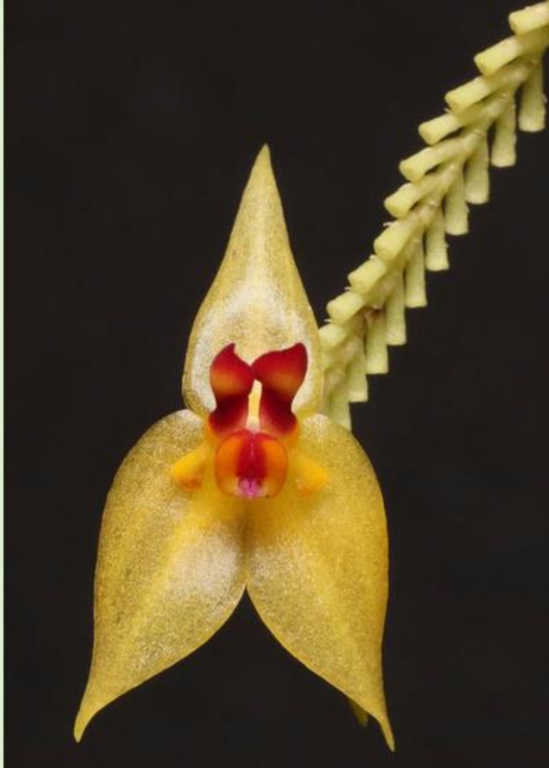
Front view of Lepanthes ligae flower.