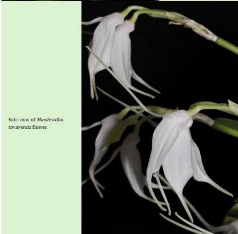
Side view of Masdevallia towarensis flower.

Masdevallia towarensis . Endemic to Venezuela at elevations of 1600 to 2400 meters as a cool to cold growing epiphyte. This orchid grows well either potted in sphagnum moss or mounted with moss on the roots. Grown by Chris Ehrlert.