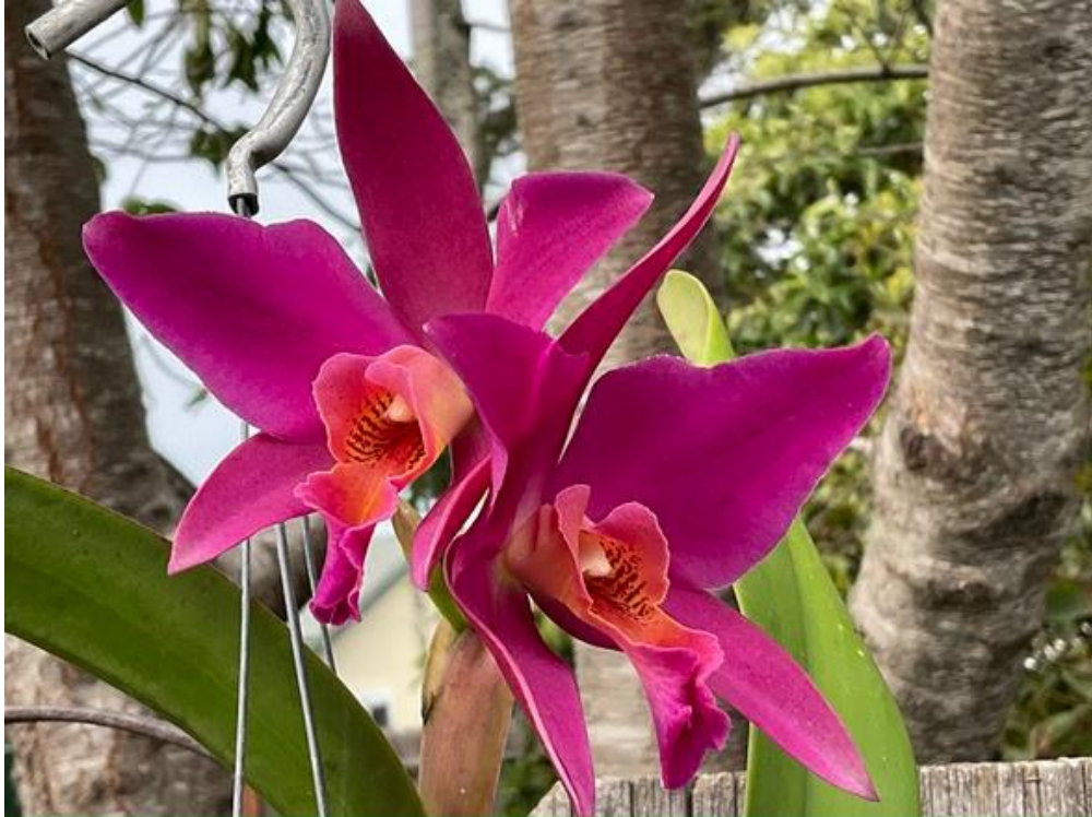
Laelia Ancibarina ( L. anceps x L. cinabarina ). The lips on these are often recurved. Grown in LECA in a hanging basket under a mock orange tree in my backyard in Los Osos, CA.