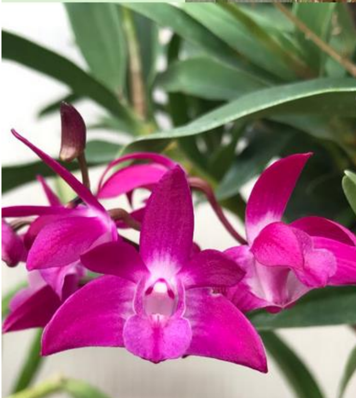
Dendrobium Jonathan's Glory 'Dark Joy' close up of the flower.