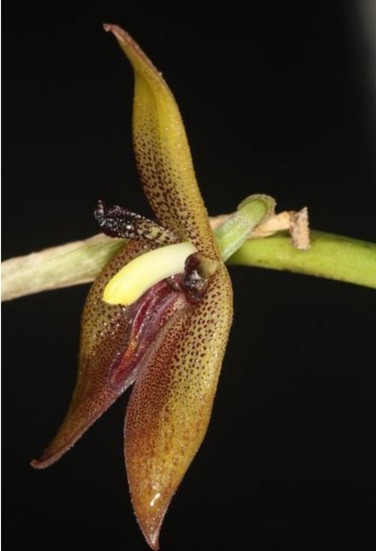
Side view of Myoxanthys serripetalus Chris AM/AOS.