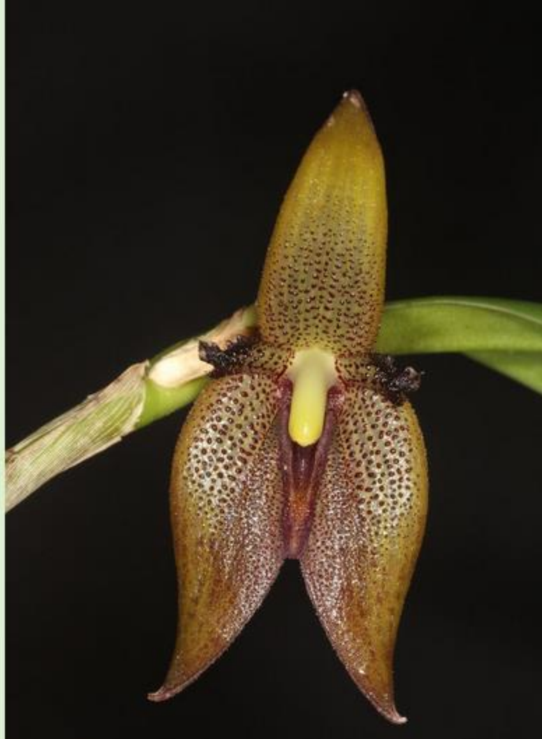
Front view of Myoxanthys serripetalus Chris AM/AOS.