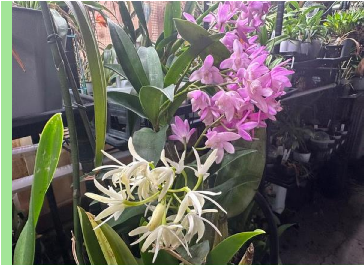
Australian dendrobium hybrids grown outside in Los Osos and freely flowering.