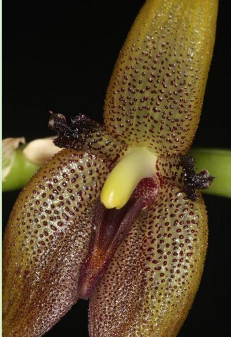
Closeup of Myoxanthys serripetalus Chris AM/AOS.