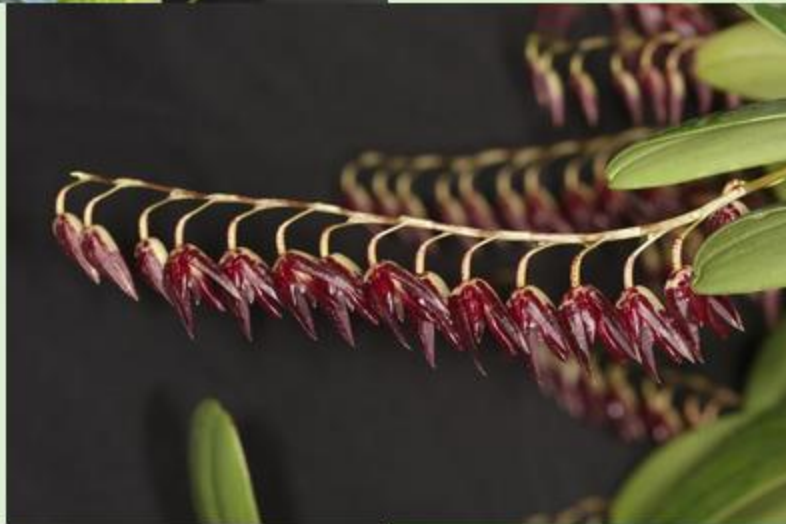
Closeup of Pleurothallis restrepiodes spike.

Pleurothallis restrepiodes . Grows natively in Colombia, Ecuador and Peru in cool to warm conditions at elevations of 800 to 2900 meters as an epiphyte or terrestrially. Grown outside in a plastic pot filled with sphagnum moss. Grown by Chris Ehrler.