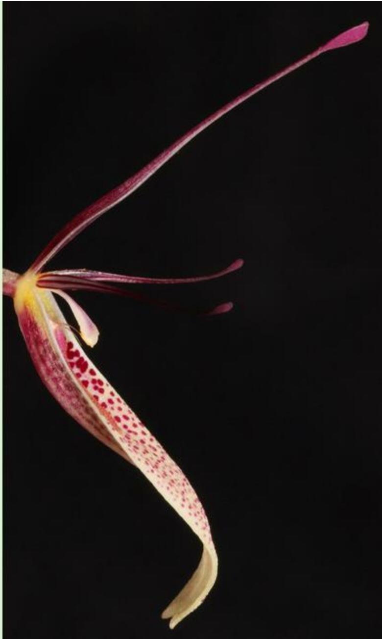
Side view of Restrepia chameleon flower.