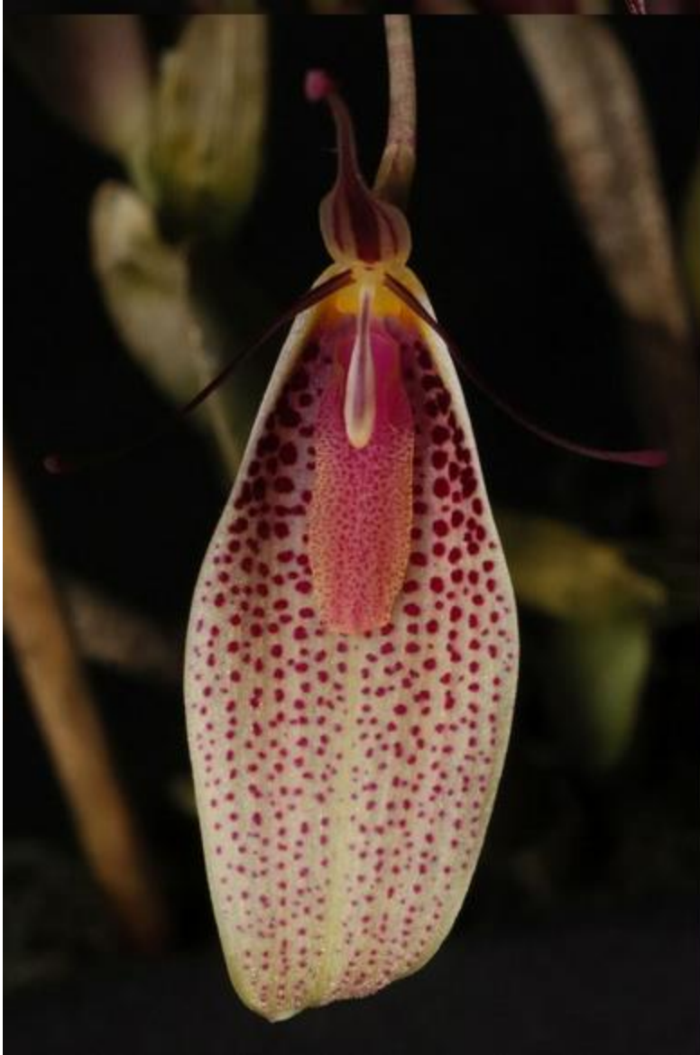
Restrepia chameleon . A cool growing epiphyte found in Norte de Santander Colombia at an elevation around 2700 meters. This orchid is growing in a cool greenhouse in a clay pot filled with sphagnum moss. Grown by Chris Ehrler.