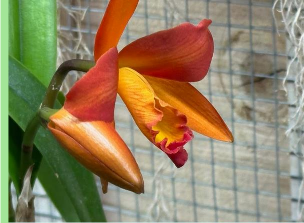
Slc. Art Deco