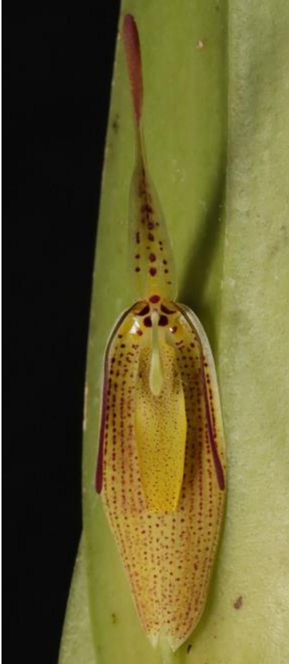
Restrepia mendozae . Native to southeastern Ecuador in the Cordillera del Condor at elevations around 1500 meters as a small sized, warm growing epiphyte. But this plant is growing well in a cool greenhouse. It is planted in sphagnum moss in a clay pot. Grown by Chris Ehrlar.