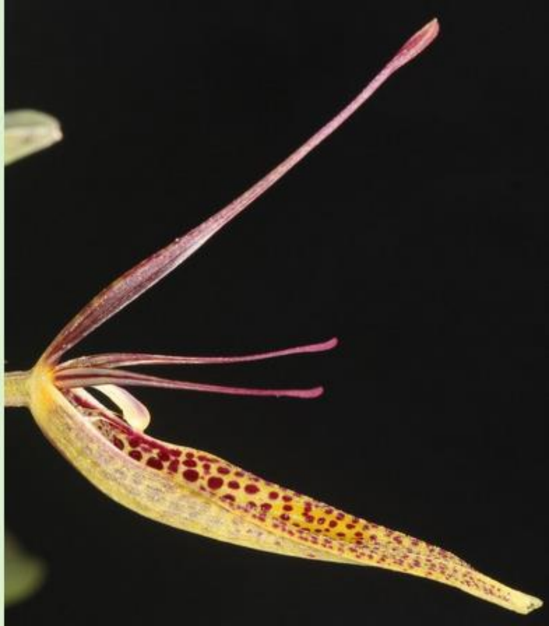
Side view of Restrepia guttulata yellow flower form.