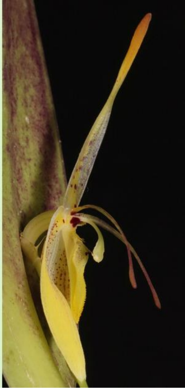
Side view of Restrepia mendozae flower.