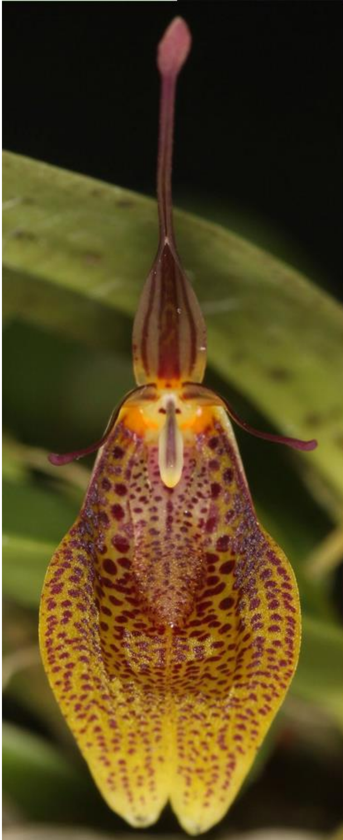
Restrepia guttulata yellow flower form. A cold to cool growing epiphyte found in Colombia, Ecuador, Peru and Venezuela at elevations of 1700 to 3000 meters. This orchid is growing in a cool greenhouse in a clay pot filled with sphagnum moss. Grown by Chris Ehrler.