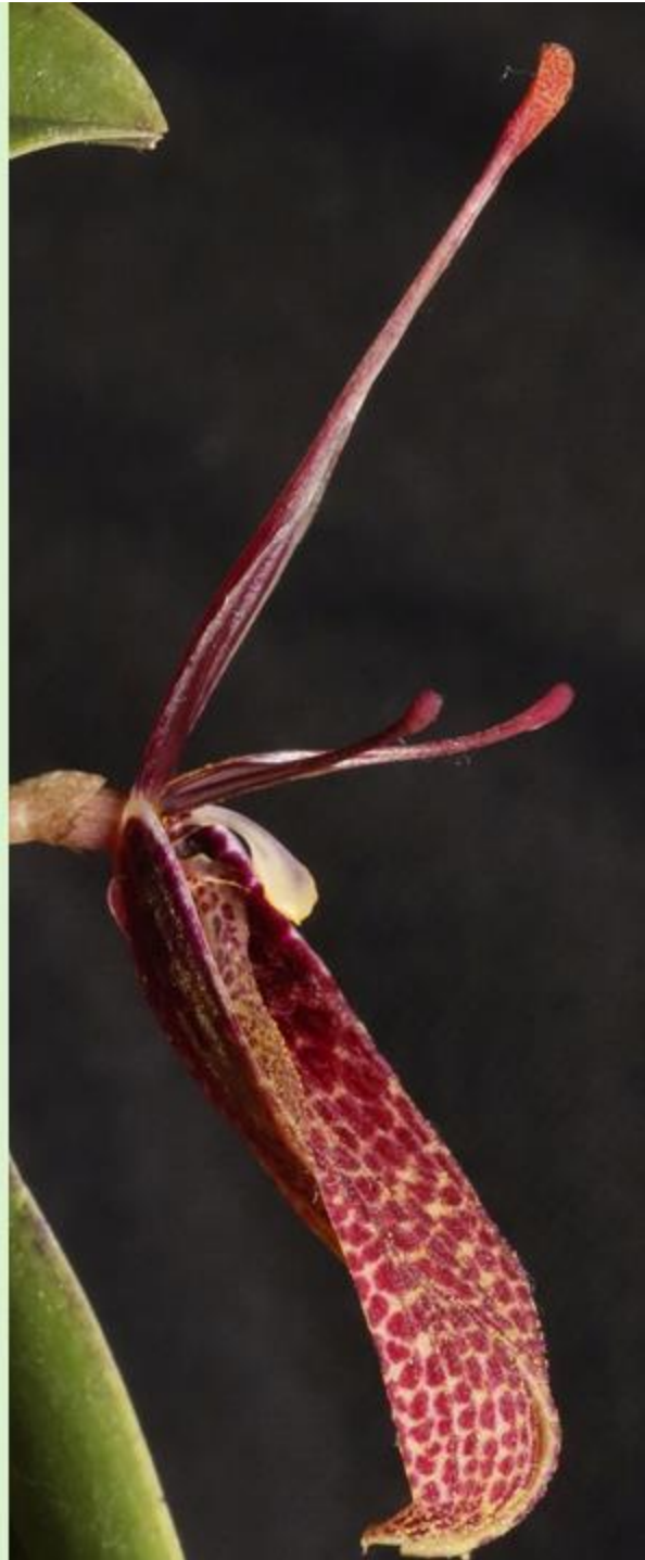
Side view of Restrepia guttulata reddish flower form.