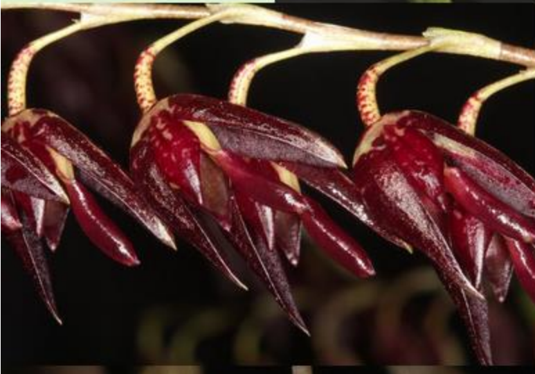
Closeup of Pleurothallis restrepiodes flowers.