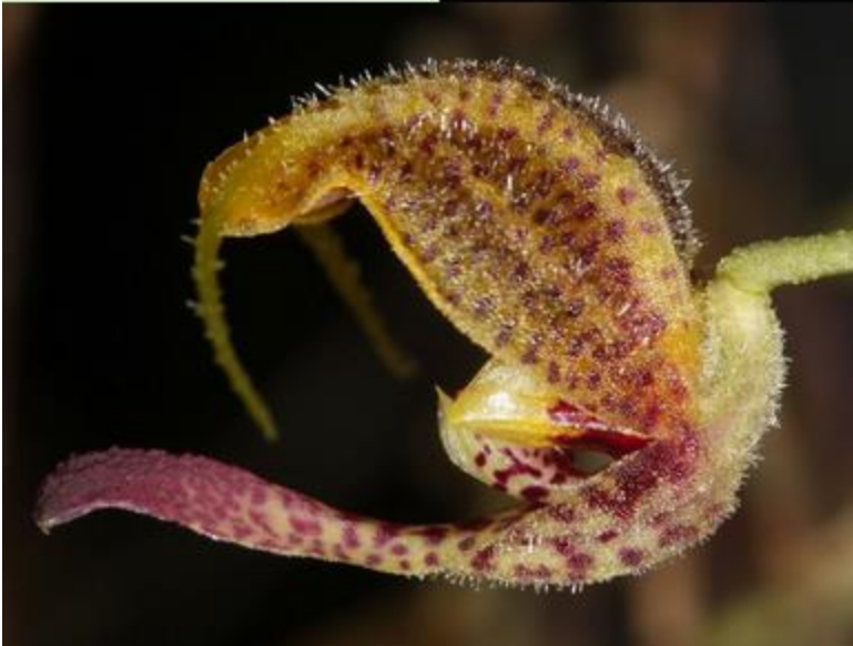
Side view of Scaphosepalum beluosum 'Kiri' flower.