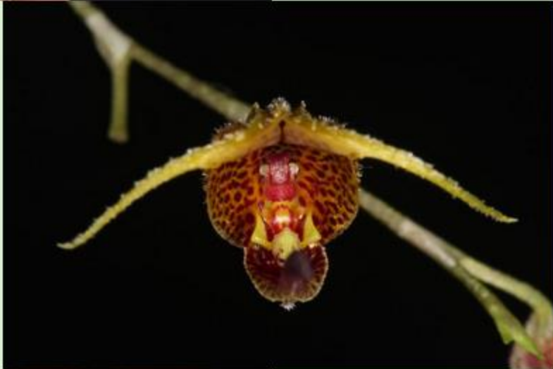
Front view of Scaphosepalum beluosum 'Kiri' flower.

Scaphosepalum beluosum 'Kiri'. Grows as a cool to cold epiphyte in at elevations from f 1500 to 2200 meters. Is growing in a plastic mesh pot filled with sphagnum moss which is hanging in a cool greenhouse. Grown by Chris Ehrler.