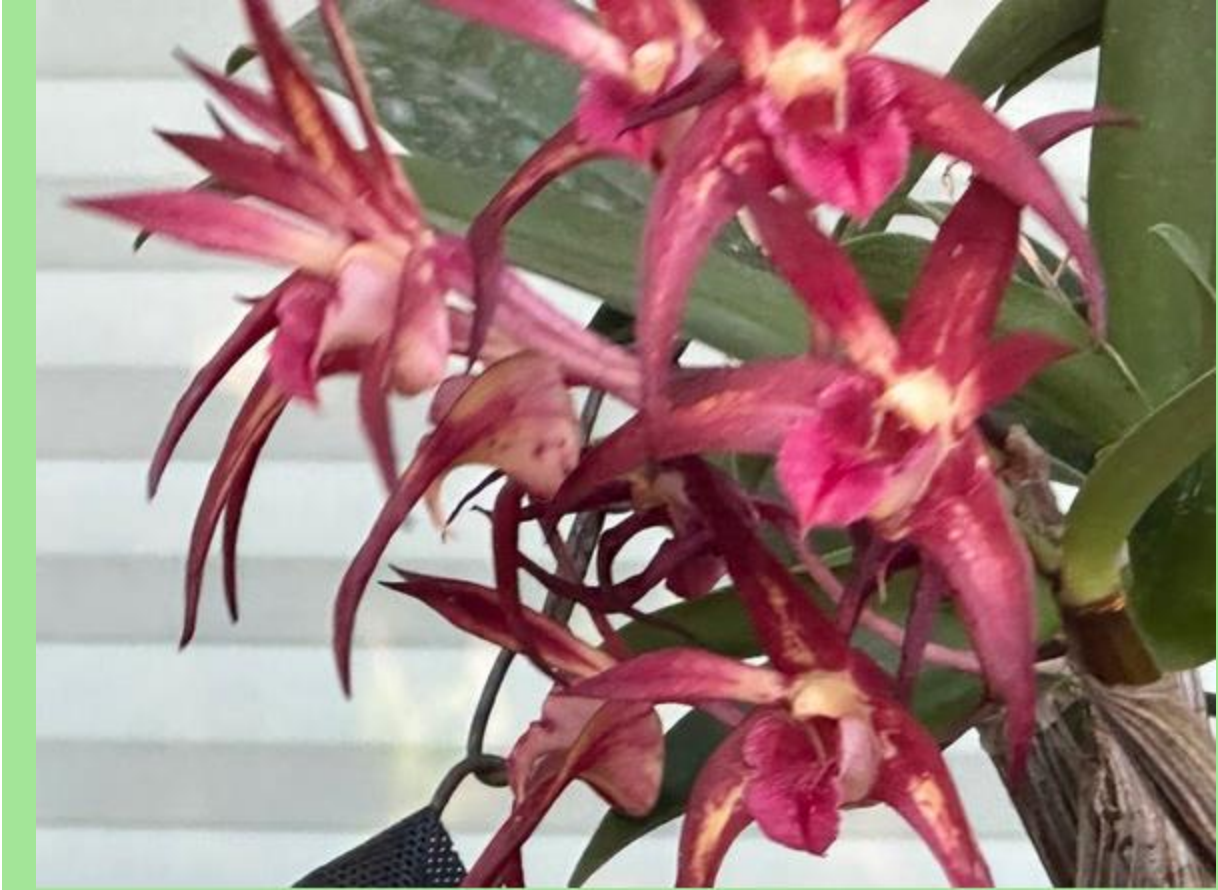
Dendrobium hybrid from Sunset Valley Orchids.