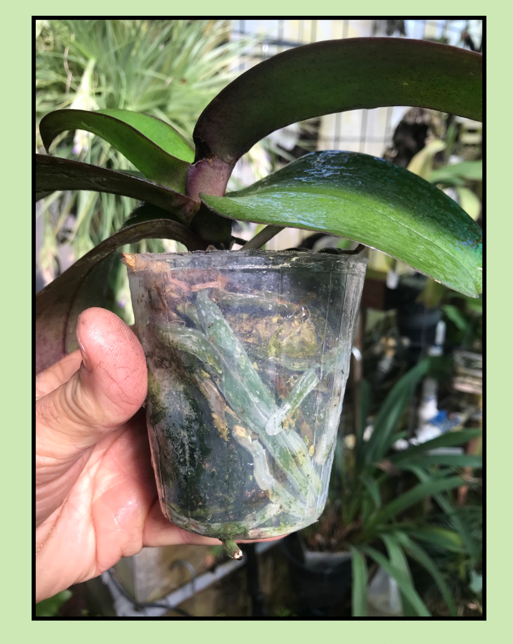
Pour in water to flush out minerals until roots turn green. Pot will feel heavy.

Water when roots are ash-gray and the pot is light when lifted. Clear pots allow roots to photosynthesize.